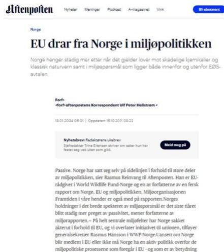
Figure 2. Aftenposten's critics on European Union Environment Policy.

Aftenposten's perspective is that the EU's policies regarding plastic waste are too focused on restricting the use of single-use plastics without considering more comprehensive solutions for plastic waste management as a whole. They emphasize the importance of involving the entire value chain in efforts to reduce and recycle plastic waste, including manufacturers, suppliers, and consumers. Aftenposten also criticizes the lack of international cooperation by the EU in addressing the issue of plastic waste. They highlight the importance of collaborating with countries outside the EU, including Norway, to achieve more effective solutions in reducing the global environmental impact of plastic waste.