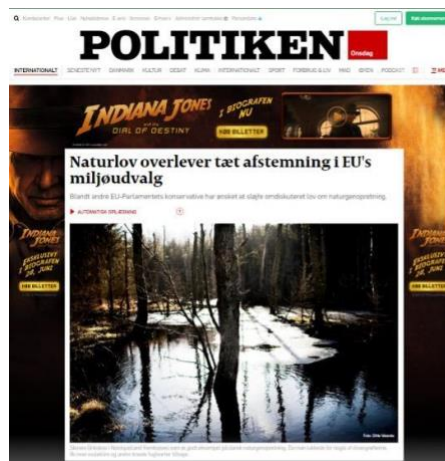
Figure 3. Politiken's coverage on EU plastic waste policy

In the context of Denmark, the media outlet Politiken focuses on EU environmental policies. They have criticized the EU's policies, particularly in the issue of plastic waste. The criticisms raised by Politiken against the EU include limitations in reducing single-use plastics. Politiken criticizes the EU for not taking enough measures to reduce the use of single-use plastics. They highlight that the EU's policies are still not sufficient to address the significant amount of plastic waste generated. Politiken may urge the EU to adopt a more stringent and integrated approach in reducing the use of single-use plastics.