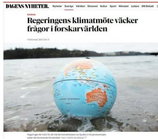
Figure 4. Dagens Nyheter's news coverage on climate issues.

Dagens Nyheter, a Swedish media outlet, has also voiced criticism of the European Union's environmental policies, particularly regarding the issue of plastic waste. Dagens Nyheter criticizes the EU for adopting policies that are not strong enough in reducing the use of single-use plastics. They argue that the existing measures are not ambitious enough to address the significant problem of plastic waste. Dagens Nyheter urges the EU to adopt stronger policies, including stricter bans or limitations on single-use plastic products, and to incentivize the use of environmentally friendly alternatives (Dagens Nyheter, 2023).