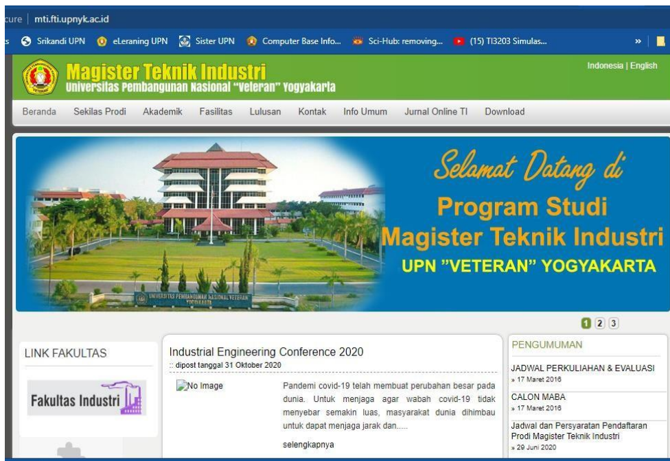
Figure1. Website MTI UPN VY