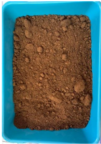
Figure 1 Mature Composted Fertilizer

Finally, every two weeks, the liquid was drained from the container and poured back into it (Abdullah, et al., 2021), to ensure that the composted food waste undergoes the aerobic breakdown process (Waqas, et al., 2018). Last but not least, compost can be produced through a post-treatment-based sifting process. Figure 1 illustrates the characteristics of mature compost, which has a pleasant soil-like aroma and dark brown colour.