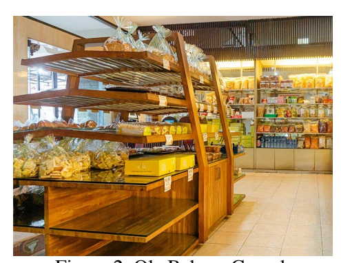
Figure 2. Ola Bakery Gowok