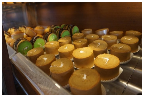
Figure 1. Example of Ola Bakery's Products