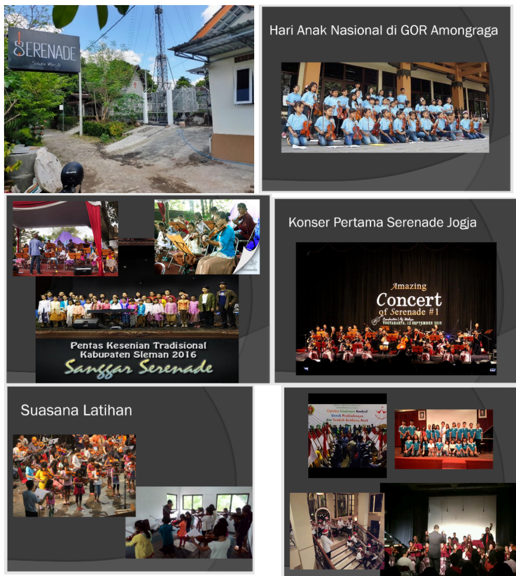
Figure 1. Location & Performance of Sanggar Serenade

Serenade Jogja is presently directed by Ag. Wahyu Wibowo and co-directed by a number of UNY and ISI Yogyakarta graduates. The following are some photographs depicting the activities in the studio.