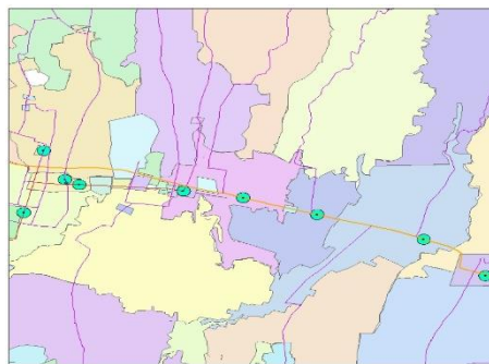
Figure 3. The Map of Area Coverage of Public Minivan Stop in Jembrana

The area coverage can be illustrated on the map below: