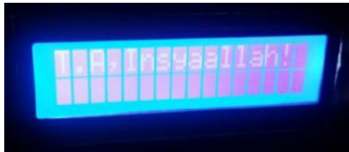
Figure 2. LCD test display

By using that program, on the LCD screen starting from column 0 in row 0, the words "TA Insha Allah" will appear as shown in the image below: