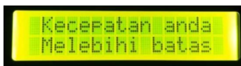
Figure 3. LCD Testing