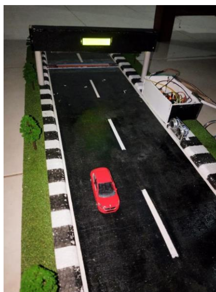
Figure 4. The Design of the Prototype

In the design of this tool, speed bumps will automatically appear on the road surface when they know there is a traffic violation, i.e., there are vehicles that pass more than a maximum speed of 20 km/hour past two ultrasonic sensors which are installed a few meters from the point where the speed bumps appear. Before the speed bumps appear on the road surface, the vehicle will be given an announcement or notification from a digital screen installed on the road that the vehicle speed exceeds the maximum limit so that the driver must reduce the vehicle's speed.