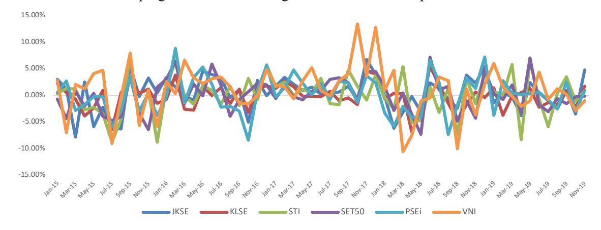
Figure 1. Stock Index Performance of ASEAN Countries

Usually, a strong country's economy can affect a weaker country's economy. As well in terms of investment. Today, investing activities are no longer limited by distance, time, and place. This is due to technological developments that make the capital market in the world able to integrate. With the integrated capital market in the world, investors can estimate the return that will be obtained in the capital market, where he invests capital with the integrated capital markets of other countries. In Asia, especially in ASEAN countries, the stock market in those countries are interesting for investors, due to the ASEAN countries mostly consist of developing countries and investment especially in the stock market in developing countries have a higher return than developed countries.